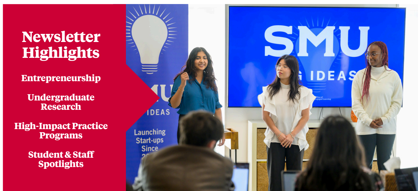
Team Elevated pitching at the Fall 2025 Big iDeas Pitch Competition. Read more on p.4