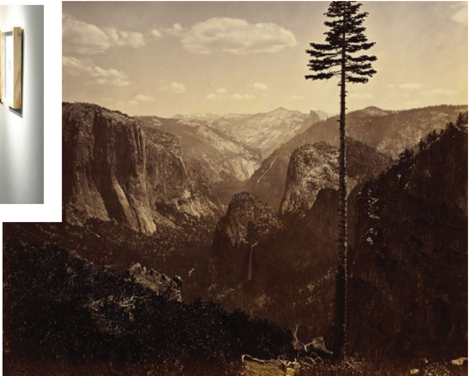
Left (top) SMU Libraries visitors viewing a collection in the Elizabeth Perkins Prothro Galleries of Bridwell Library. Left (bottom) Visitors at the Torn Apart exhibit at Hamon Arts Library. Right "Yosemite Valley from the 'Best General View'" (1866)