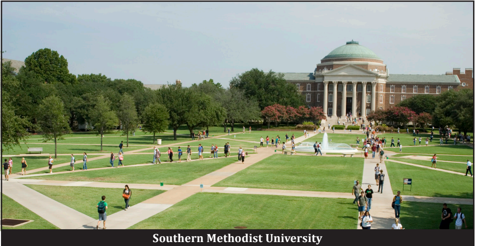
Southern Methodist University