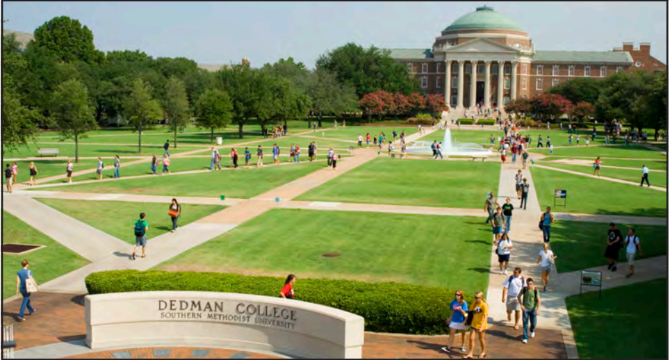
Southern Methodist University