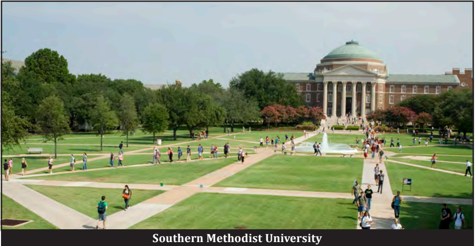
Southern Methodist University