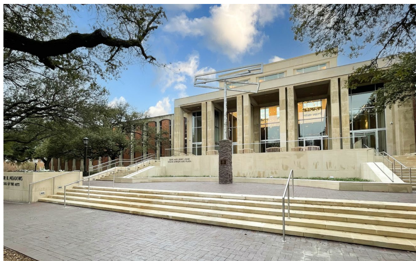
Awarded: July, 2023, LEED Silver