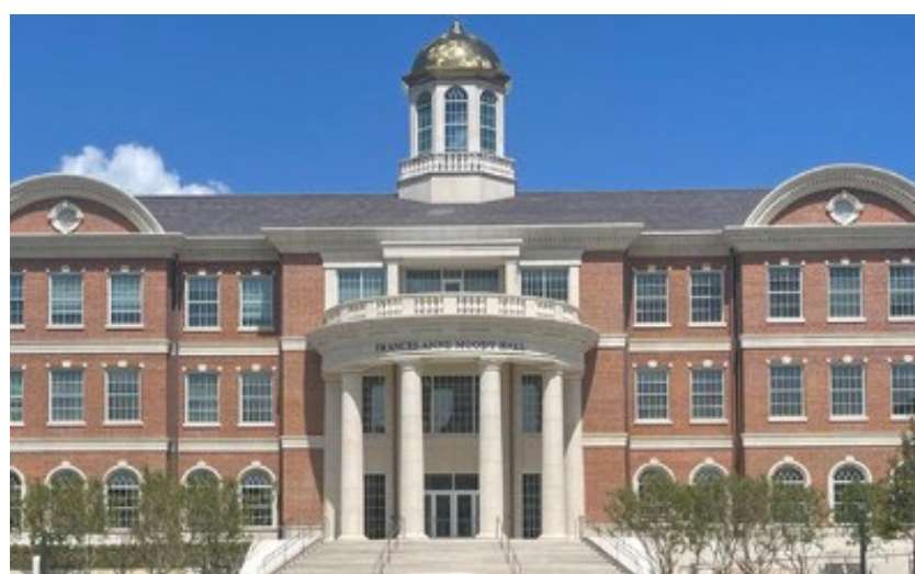
Awarded: March, 2024, LEED Certified