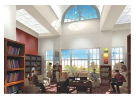
The third floor reading room houses books and research materials for graduate students and faculty.