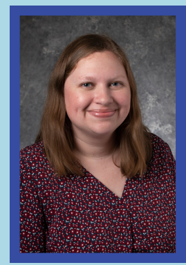
C.J. Enloe Department of World Languages and Literature -Spanish

The President's Commission on the Needs of Persons with Disabilities (PCNPD) provides funding and support for this award, demonstrating how much SMU values faculty sensitivity to this somewhat vulnerable, yet very capable population.