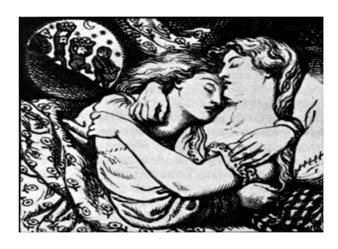
From Rosetti's Goblin Market (1862)

The last panelist tackled the traditionally male-dominated genre of science fiction film, pointing out the "damsel in distress" and "sex kitten" roles women inhabit in these films. He showed how the early 1990s redefined the roles of motherhood by transforming the very ideas of what "traditional" mothers did. Women in these films do not stay at home and cook. They