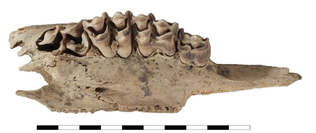
Figure 3. The gemshok (Oryx gazella) right maxilla from Level 24 (Layer 9A) Reception Shelter. (Scale in 10mm intervals.)