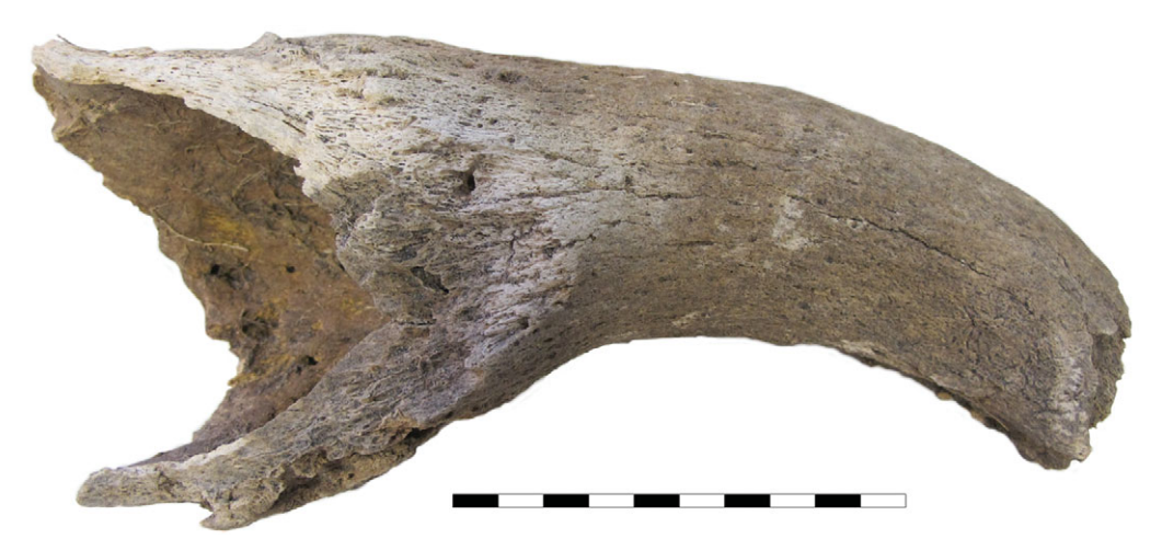
Figure 2. The directly dated and genetically identified cow (Bos taurus) horn core from KN2005/041. (Scale in 10 mm intervals.)