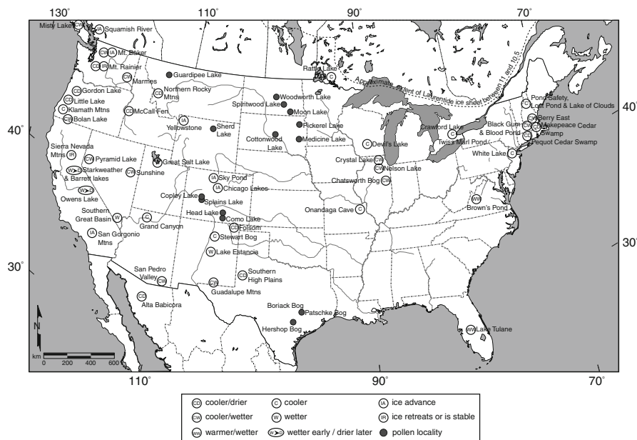
Fig. 1 Base map of North America, showing localities for which there is evidence of climate and climate change during the Younger Dryas Chronozone, as well as the location of pollen sites listed in Table 1. See the legend for symbol information. References for information on the localities shown on the map: Alta Babilicora (Metcalfe et al. 2000); Barrett Lake (MacDonald et al. 2008); Berry East, Black Gum, Blood Pond (Lindbladh et al. 2007); Bolan Lake (Briles et al. 2005); Boriack Bog (Bryant 1977); Brown's Pond (Kneller and Peteet 1999); Chatsworth Bog, Crystal Lake, and Nelson Lake (Grimm 2008); Chicago Lakes (Benson et al. 2007); Como Lake (Shafer 1989); Copley Lake (Fall 1997); Cottonwood Lake (Barnosky et al. 1987); Crawford Lake (Yu and Eicher 1998); Devil's Lake (Grimm and Jacobson 2004); Folsom (Balakrishnan et al. 2005); Gordon Lake (Grigg and Whitlock 1998); Grand Canyon (Cole and Arundel 2005); Great Salt Lake (Oviatt et al. 2005); Guadalupe Mountains (Polyak et al. 2004); Guardipee Lake (Barnosky 1989); Head Lake (Shafer 1989); Hershop Bog (Larson et al. 1972); Klamath Mountains (Vacco et al. 2005); Lake Estancia (R.S. Anderson et al. 2002); Lake Tulane (Grimm et al. 2006); Little Lake (Grigg and Whitlock 1998); Makepeace Cedar Swamp and Pequot Cedar Swamp (Newby et al. 2000); Marmes (Huckleberry and Fadem 2007); McCall Fen (Doerner and Carrara 2001); Medicine Lake (Allen 1992; Radle 1981); Misty Lake (Lacourse 2005); Moon Lake (Laird et al. 1996); Mt. Baker (Kovanen and Slaymaker 2005); Mt. Rainier (Heine 1998); Northern Rocky Mountains (Brunelle et al. 2005); Onondaga Cave (Denniston et al. 2001); Owens Lake (Mensing 2001); Patschke Bog (Camper 1991); Pickerel Lake (Watts and Bright 1968); Pond Safety, Lost Pond, Lake of Clouds (Cwynar and Spear 2001); Pyramid Lake (Briggs et al. 2005); Rattle Lake (Björck 1985; Grimm and Jacobson 2004); San Gorgonio Mountains (Owen et al. 2003); San Pedro Valley (Haynes and Huckell 2007); Sherd Lake (Burkart 1976); Sierra Nevada Mountains (James et al. 2002); Sky Pond (Menounos and Reasoner 1997); Southern Great Basin (Quade et al. 1998); Southern High Plains (Holliday 2000a); Spiritwood Lake (McAndrews, n.d.); Splains Lake (Fall 1997); Squamish River (Friele and Clague 2002); Starkweather Lake (MacDonald et al. 2008); Stewart Bog (Jiménez-Moreno et al. 2008); Sunshine (Huckleberry et al. 2001); Twiss Marl Pond (Yu 2000); White Lake (Yu 2007); Woodworth Lake (McAndrews et al. 1967); Yellowstone (Licciardi and Pierce 2008)

Nordt et al. 2008, pp. 1607–1608); and, specifically in regard to the southeast, that the shutdown of the MOC reduced the export of heat to the north, warming the southeastern Atlantic coast (Grimm et al. 2006, p. 2206; Grimm and Jacobson 2004). It seems doubtful that cultural changes in southeastern North America can be attributed to the 'severe cold' of the YDC (e.g. Dunbar and Vojnovski 2007, p. 179).