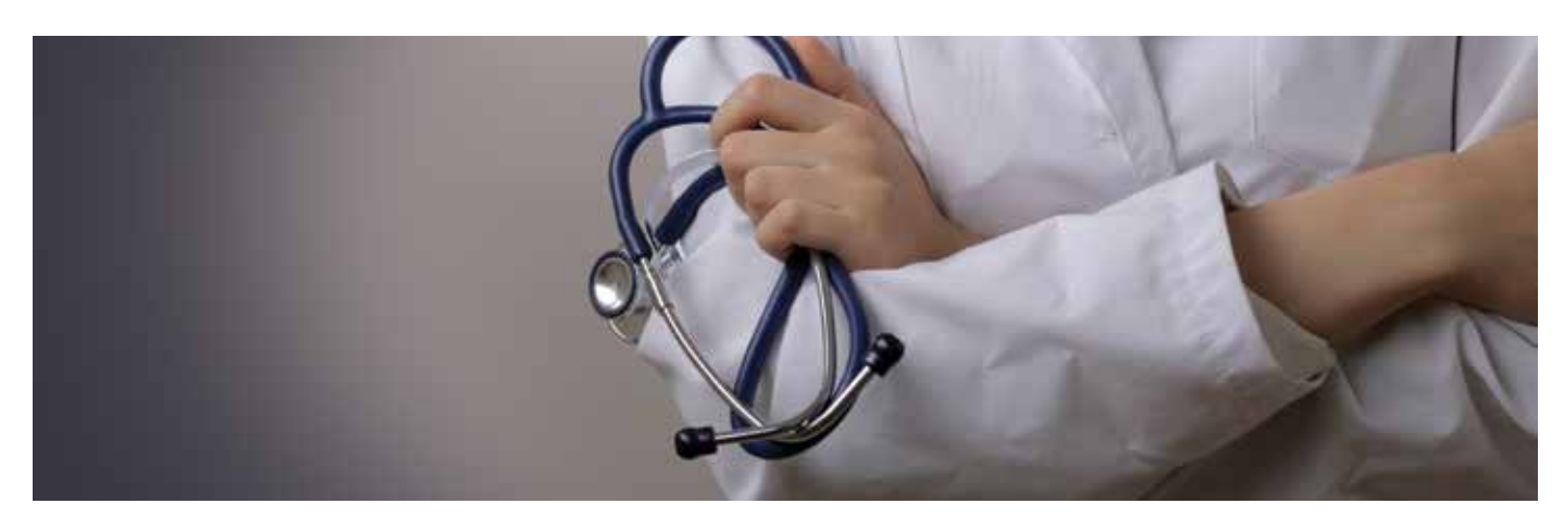
Visit smu.edu/hr > Benefits and Wellness > Health and Other Benefits > Health > Medical Plans

For the most current list of in-network providers, go online to the Doctor and Hospital Finder at <a href="https://www.bcbstx.com">www.bcbstx.com</a> (select Blue Choice PPO plan option when prompted).