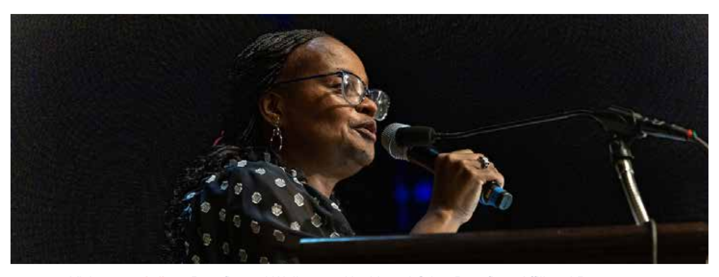
Visit <u>smu.edu/hr</u> > Benefits and Wellness > Health and Other Benefits > Affiliated Programs > Caregiving Support Program