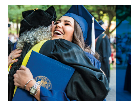
94% OFF THE MARKET for Cox BBA Class of 2023 around the time of graduation, with an average starting salary of $76.7K per year

Prepare for the business of changing the world.