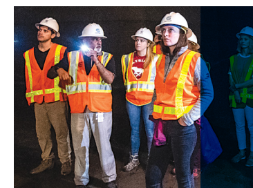
SMU alumni among the HIGHEST-PAID GRADUATES in computer and information science according to College Factual