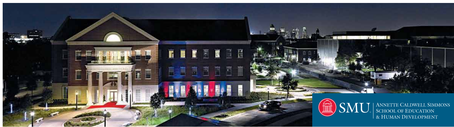
The Annette Caldwell Simmons Hall brightens the night before its dedication, September 24. For more on the event, see page 3.