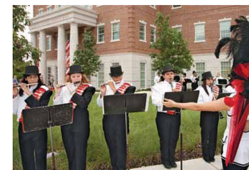
The Hillcrest High School Marching Band from the Dallas Independent School District adds a high note to the festivities.