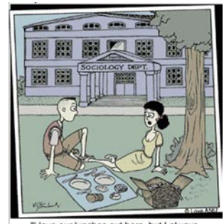
"I love our lunches out here, but I always get the feeling that we're being watched

I want this class to be enlightening, educational, and fun for you! In order to achieve these ends, each of you in the class must feel both engaged and secure enough to be able to question what you read, see, and hear (inside and outside class) and state your opinion on sometimes controversial matters. With that in mind, I want to make it clear that while I want to promote such open discussions, it must be conducted with utmost respect for your classmates and me.