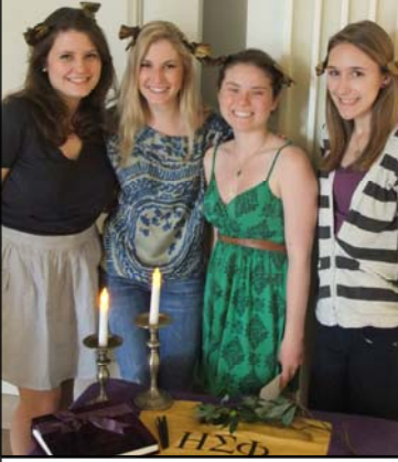
2011-2012 officers of Eta Sigma Phi National Honorary Society for Students of Latin and Greek

Gathering on March 3, Eta Sigma Phi Officers inducted new members into the Alpha Gamma Chapter of the National Honor Society for Students of Greek and Latin.