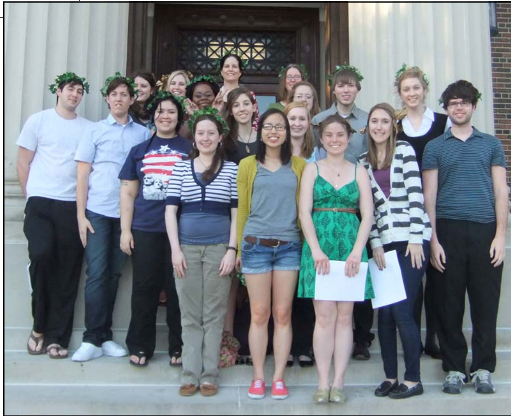
Eta Sigma Phi Induction of New Members