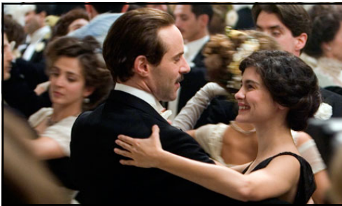
Coco Before Chanel (2009)

The SMU French Club hosted the 15 th annual French Film Festival from March 25 th to April 9 th . The Festival was co-sponsored by the Cultural Services of the French Embassy, the French Ministry of Culture, the Florence Gould Foundation, and the Franco-American Cultural Fund, among others. It was held in the SMU theatre in the Hughes-Trigg student center. A total of 5 franco-phone films were screened, including Anne Fontaine's Coco Before Chanel (2009), Rachid Bouchareb's Days of Glory (2006), and Mahamet-Saleh Haroun's Daratt (2006). Most of the films were from