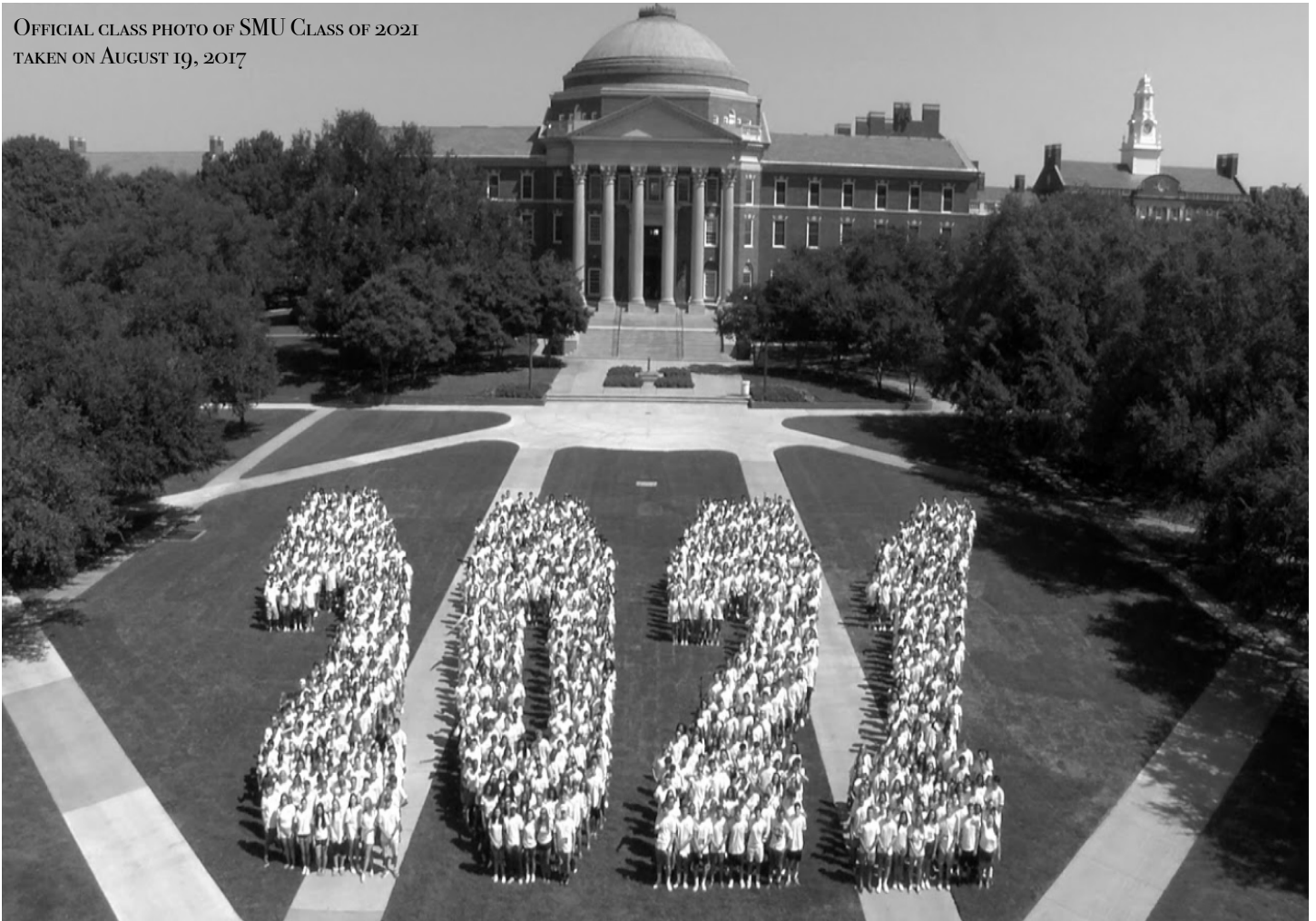
OFFICIAL CLASS PHOTO OF SMU CLASS OF 2021 TAKEN ON AUGUST 19, 2017

College can be exciting, confusing, and terrifying all at once, but I hope the wisdom I've imparted upon you, as well as the mistakes I've made, will serve you well in the present and the future. Class of 2021, your first year really will end too fast, so don't be afraid to be spontaneous, make dumb mistakes, and create memories you'll hold onto for the rest of your life.