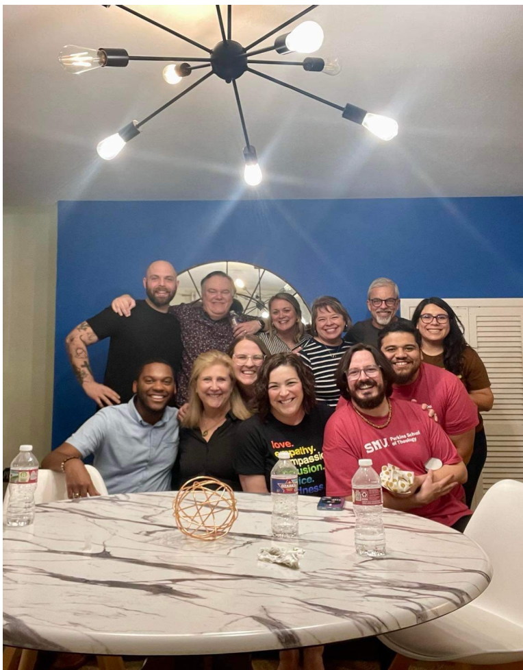
Left: Students gathered happily in Houston during the face to face portion of their Spring coursework.