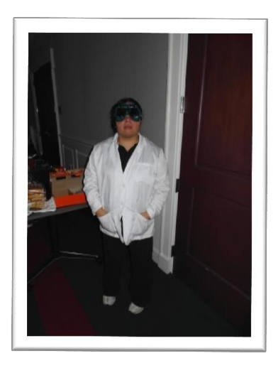
Daphne as a Mutated Minion