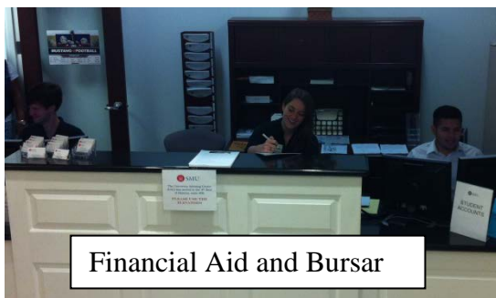
Financial Aid and Bursar