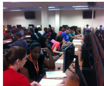
Student's leaning about the college application process at Camp College