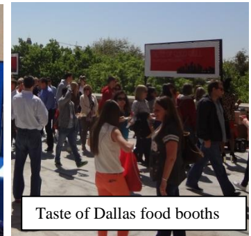
Taste of Dallas food booths