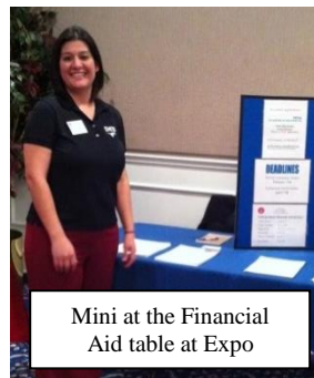
Mini at the Financial Aid table at Expo