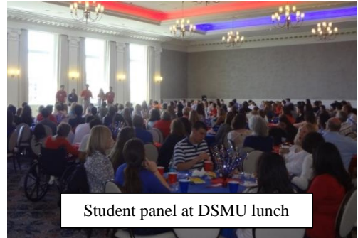
Student panel at DSMU lunch