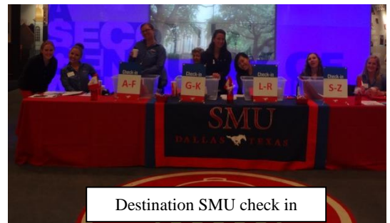
Destination SMU check in