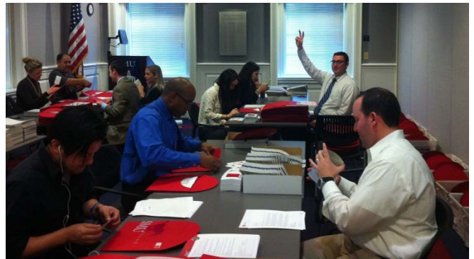
Admission Staff hard at work on prepping admission packets!