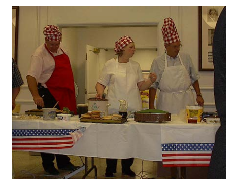
"Is there anything left?"