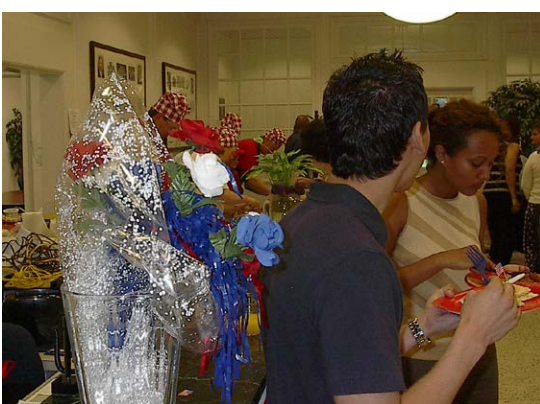
What a great way to start the day.