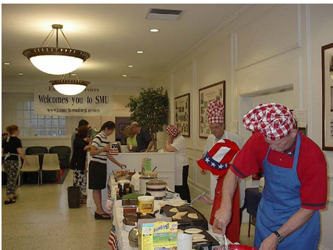
I think we found the true calling of our Leaders!