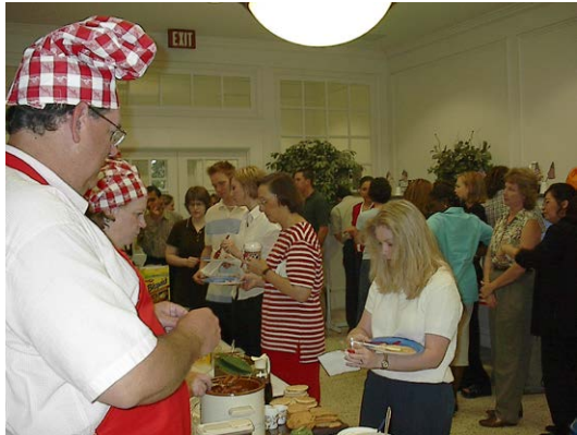
Do we really have this many people in DES?