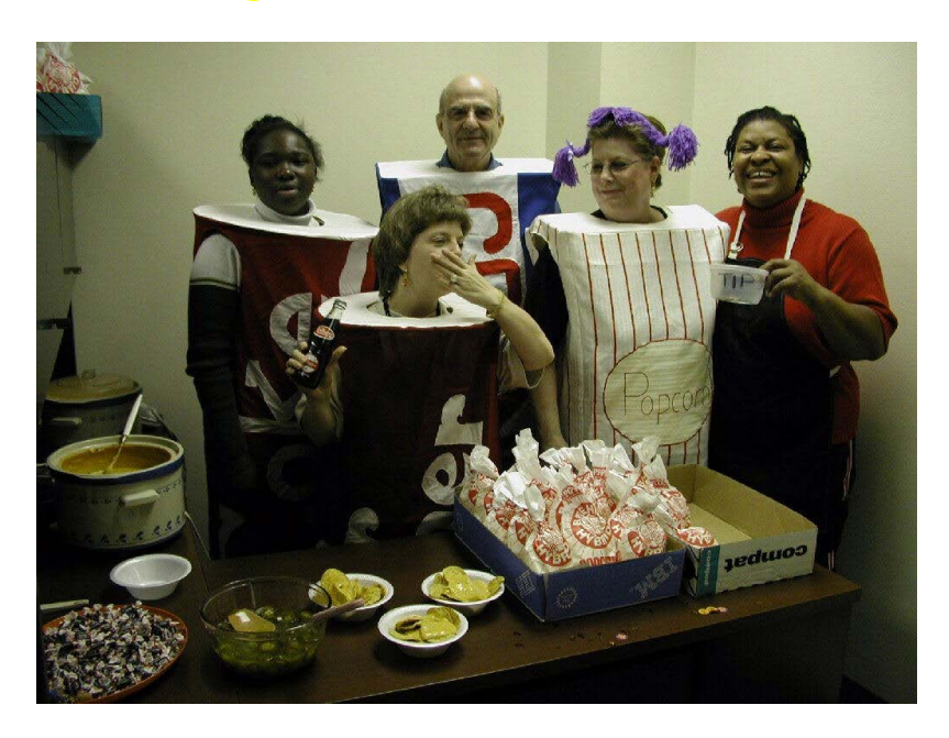
Those wacky folks on the Garden Level Thanks for the Food!