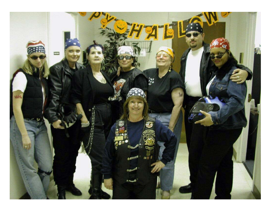
There's MORE of them!