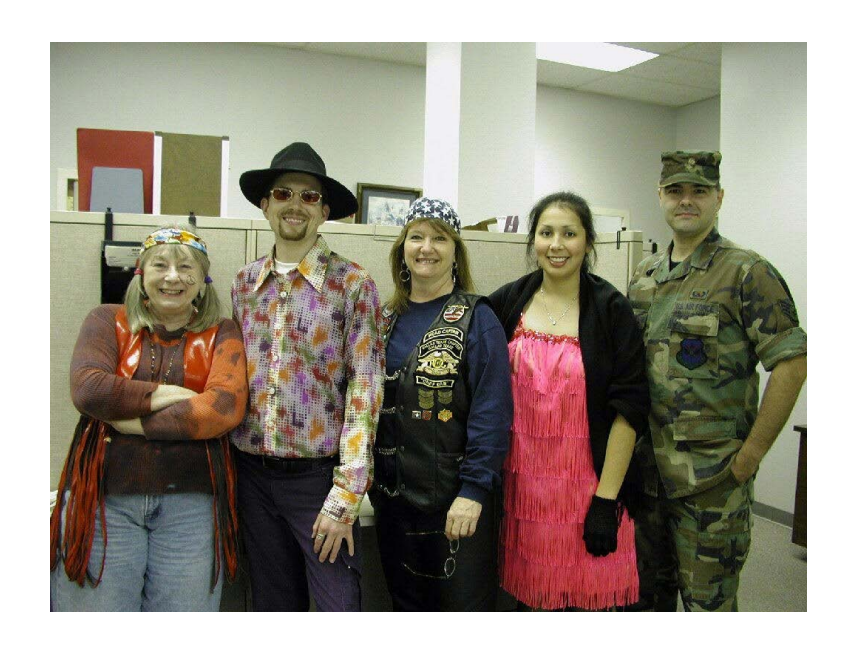
Age of Aquarius?????