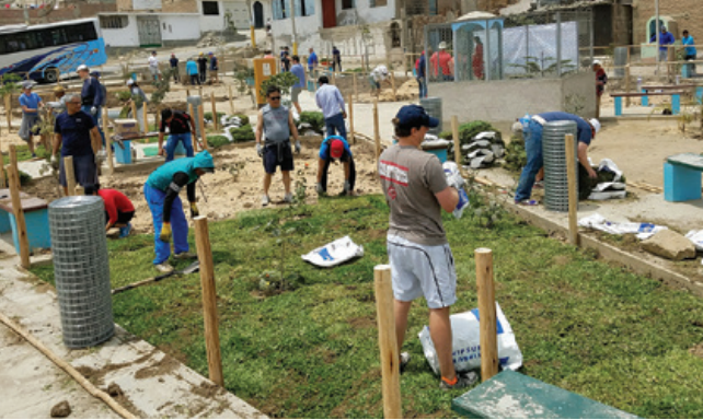
EMBA students give back. The class of 2017 helped build a community park in Lima, Peru.