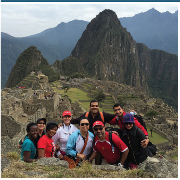
Partners and spouses are invited to participate in the global trip.