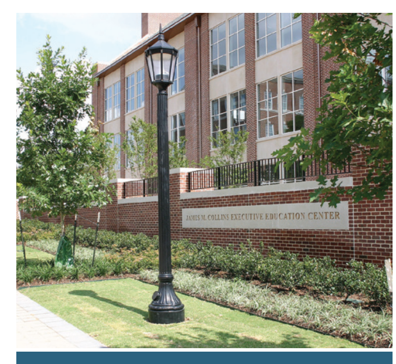
The James M. Collins Center was built in 2005 and is the academic center of the Executive MBA Program. The center includes classrooms, an auditorium, a dining room, an executive lounge, study rooms, conference rooms and a rooftop terrace.

Brierley Institute for Customer Engagement Caruth Institute for Entrepreneurship Don Jackson Center for Financial Studies Management Center Folsom Institute for Real Estate Kitt Investing and Trading Center Latino Leadership Initiative Maguire Energy Institute Niemi Center for American Capitalism O'Neil Center for Global Markets and Freedom Southwestern Graduate School of Banking