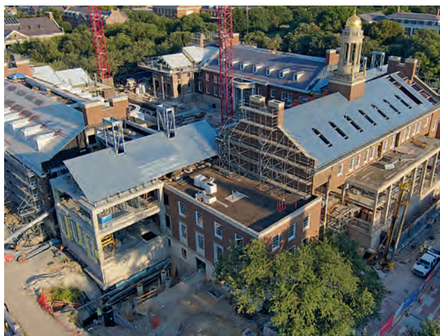
Cox renovations – SMU broke ground on a $140 million renovation and expansion project designed to train students for a collaborative and technologically integrated world.