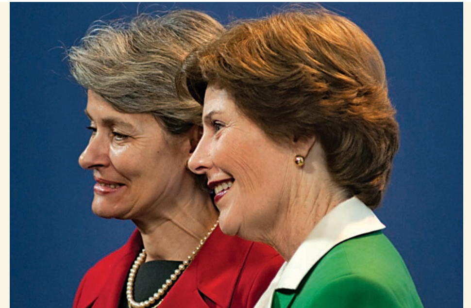
First Lady Laura Welch Bush '68 (right) and UNESCO Director-General Irina Bokova welcome 300 participants to "Educating and Empowering the Women and Girls of Afghanistan," a Bush Institute conference held on March 19, co-sponsored by the U.S.-Afghan Women's Council and the Annette Caldwell Simmons School of Education and Human Development.