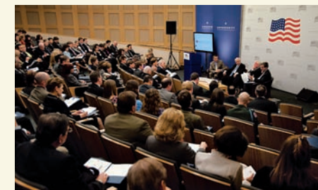
Education leadership topped the agenda of the first Bush Institute symposium March 3. The conference was co-sponsored by the Annette Caldwell Simmons School of Education and Human Development.