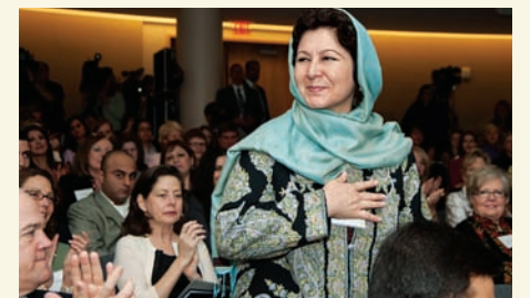
Husn Ghazanfar, Minister of Women's Affairs in Afghanistan, attends the Bush Institute conference on educating Afghan women and girls.

News, research and people from SMU's Annette Caldwell Simmons School of Education and Human Development