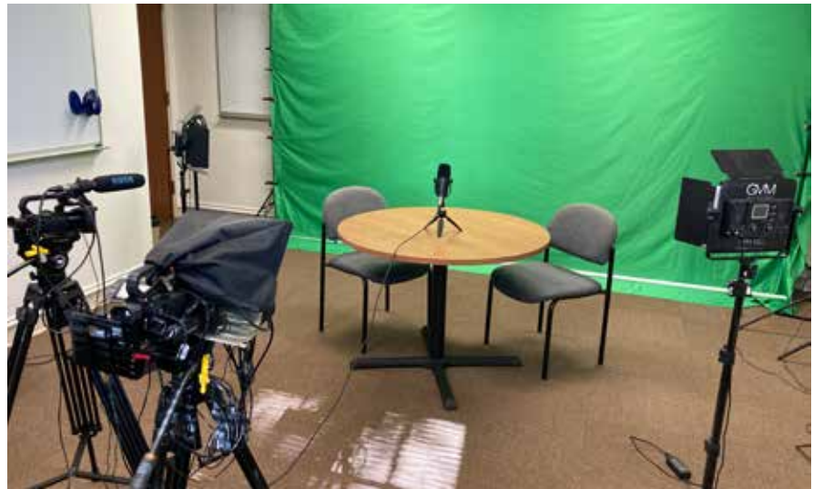
A green screen and podcasting studio are part of Perkins' new Digitally Mediated Ministries Lab.