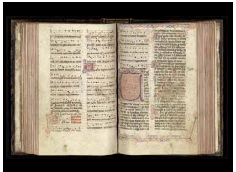
This Catholic Missal (ca. 1400) was used to guide liturgy, prayer and preaching.