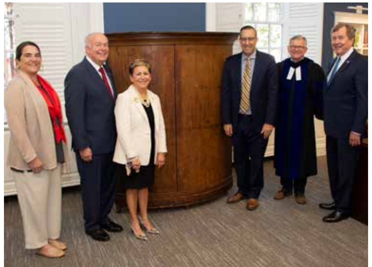
Visitors often ask to see John Wesley’s personal traveling pulpit, a recent acquisition at Bridwell.

Bridwell recently received John Wesley’s personal traveling pulpit. I look at it often and it has become one of our most visited and treasured possessions. When tour groups, church congregations, or student seminars visit Bridwell they almost immediately ask, “Can we see the Wesley pulpit?” They come to it with great energy and enthusiasm and touch it, look behind it, pose with it for photos. A smaller pulpit from an island in Great Britain, a mere thirty feet away, often stands ignored. While the curiosity and admiration of the Wesley pulpit has its role, the benefits of Bridwell’s collections goes well beyond the tangibility of communing with the same objects that were once owned and presided over by the founder of Methodism. These are important distinctions and have particular meaning and significance, because the notion of a pulpit emotes its own constellation of attachments, respect, sobriety, humility, and distinction. That place where one preaches from may be a physical place, but it is imbued with the powers of credentials, practice, and