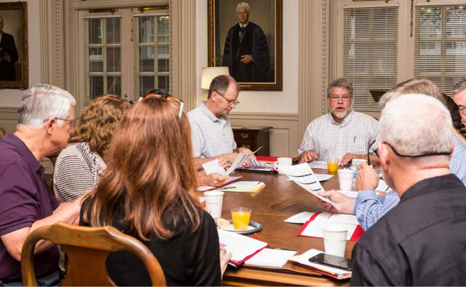
Participants gathered for a preaching workshop on storytelling hosted by the Perkins Center for Preaching Excellence.