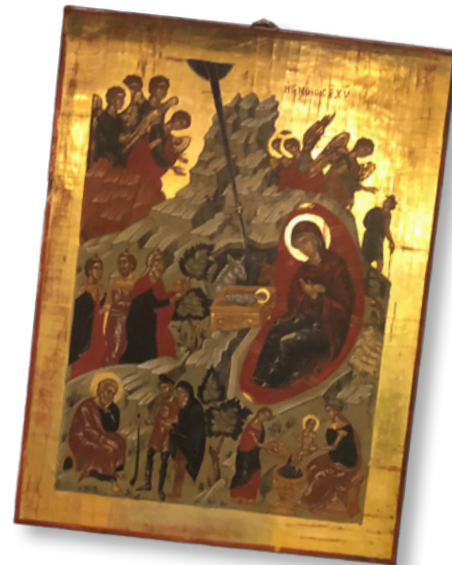
Above Iconographic art from the World Methodist Collections offers a wide array of objects for researchers to study. Below John Wesley's traveling pulpit comes to SMU as part of the collection.

“The collections will significantly enhance our holdings in Methodistica and Wesleyana such that Bridwell Library will be one of the most important destinations for church historical research – certainly in North America, and perhaps even worldwide. Once on site, we will prioritize the organization of collections; digitization of hundreds of archival letters and documents by and about early Methodist leadership; and curation of a wide-ranging variety of cultural artifacts. It is a tremendous addition and will be a game-changer in so many ways.”